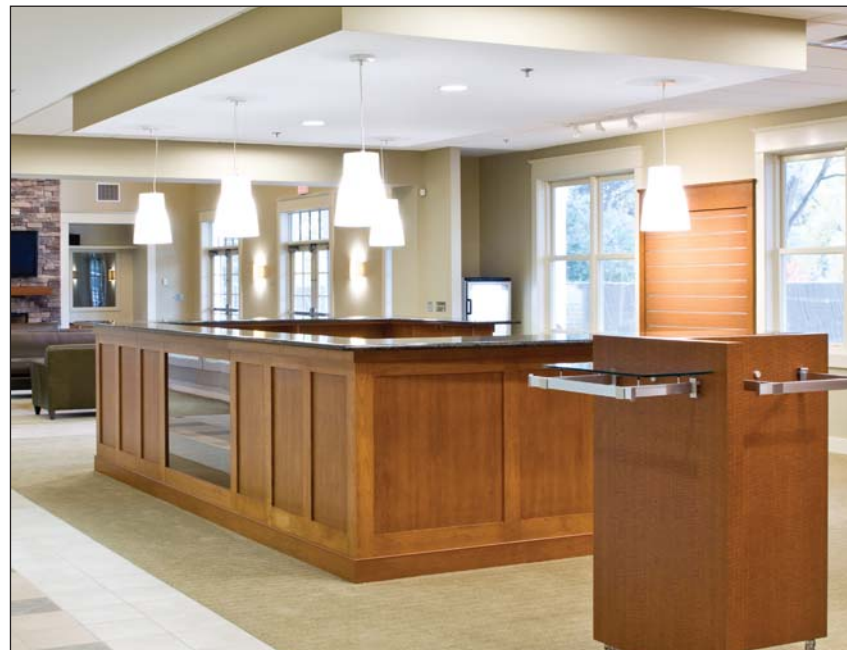
Woodmont Country Club Tennis

Can be used with any type of tennis surface chosen